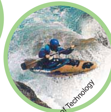
Christchurch Polytechnic Institute of Technology