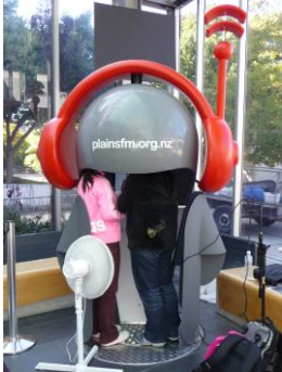
Students using the Plains FM Pod

The CPIT Student Services Expo, was held on the 4 th March in the Rakaia Centre and included participation from the International Services, Library, Learning Services, Disability Services, Career Centre, Plains FM, the Health Centre and the Student's Association.